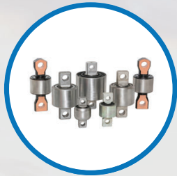
Bushes & Ball Joints