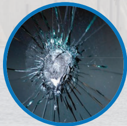
Bullet Resistant Glass